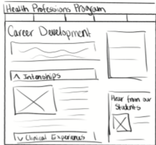
A rough sketch of the "Career Development" page, featuring collapsible sections and a sidebar menu for student stories.

By implementing this design direction, the new HPP website will be more user-friendly, accessible, and effective in guiding students, alumni, and faculty through their information-seeking goals.