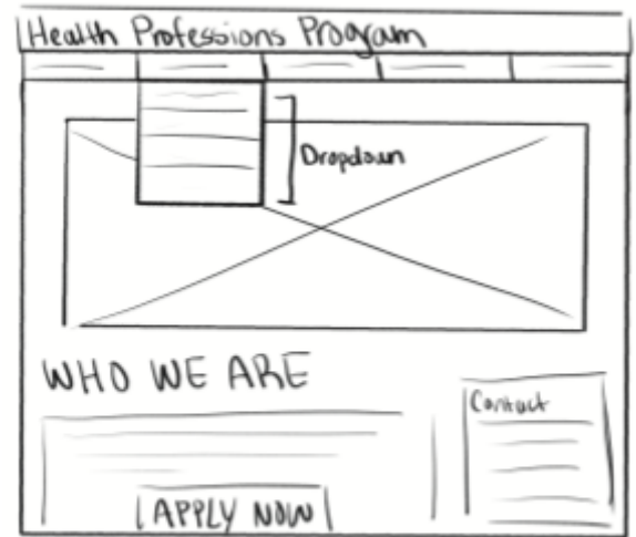
A rough sketch envisioning the layout of the homepage redesign. This basic format (an image header, sections with titles, and sidebar menus) will also be applied to other pages not sketched here (i.e. “Alumni Resources”).