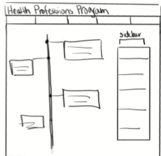
A rough sketch of the “Timeline” subcategory. This page is a bit different from the rest as it attempts to clearly visualize the important dates of the medical school application process.